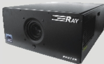
42' - 47' Screens