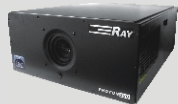
47' & above Screens