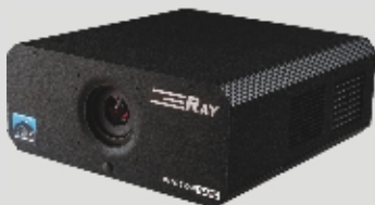
35' - 42' Screens