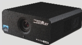
35' - 42' Screens