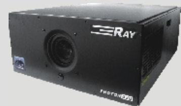
47' & above Screens