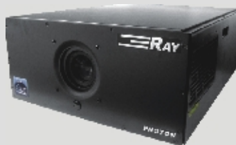
42' - 47' Screens